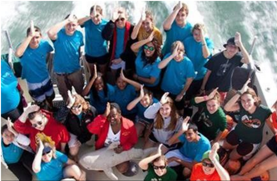
Shark Club Field Trip